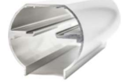
Euro Header (2,6,7,8)