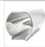
Euro Header (2,6,7,8)