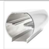
Euro Header (2,6,7,8)