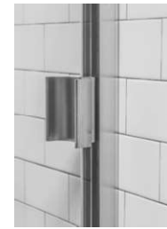
Handle / Full Height Magnetic Latch (2,6,7,8)