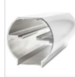
Euro Header (2,6,7,8)