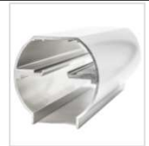
Euro Header (2,6,7,8)