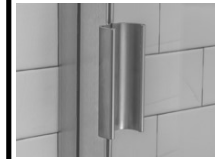
Low Profile Handle (2,6,7,8) / Full Height Framed Magnetic Latch