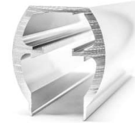
Heavy Duty Euro Header (2,6,7,8)