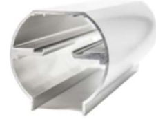
Euro Header (2,6,7,8)