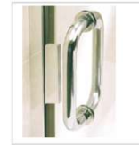
Handle (1,5) / Magnetic Latch