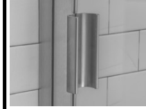
Low Profile Handle (2,6,7,8) / Full Height Framed Magnetic Latch